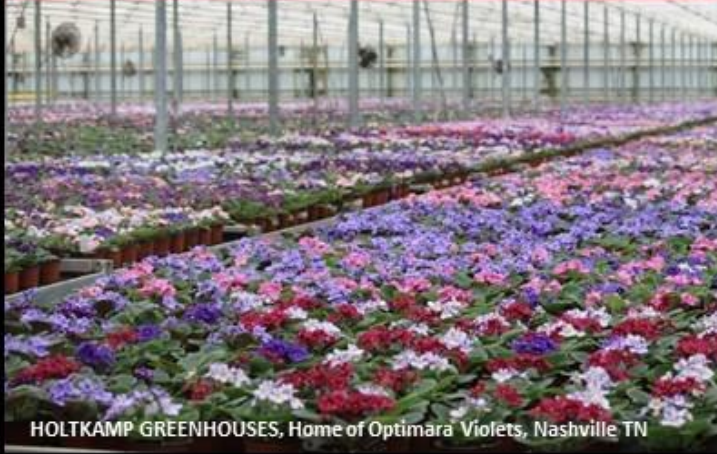
HOLTKAMP GREENHOUSES, Home of Optimara Violets, Nashville TN