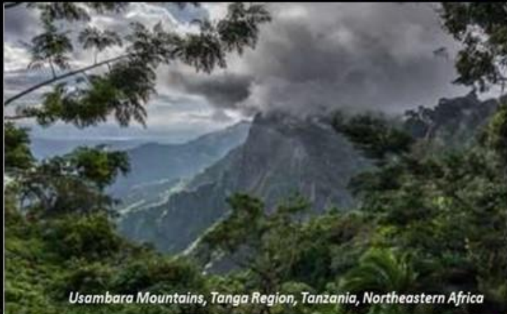
Usambara Mountains, Tanga Region, Tanzania, Northeastern Africa