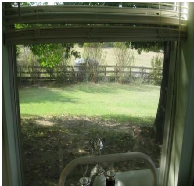
The window where the tank can be seen next to the fence downhill from the house.

What many people may not be aware of is the inventive way that Ray has rigged up to obtain clean water for the African Violets and Streptocarpus on the many plant stands. Attached to all the downspouts of the Pittman home is 4 inch corrugated tubing. This tubing is buried and goes downhill to a 1500 gallon water tank. A pump and conventional water piping is located in the tank to pump the water back into the house when needed for plant watering. Ray has a story that back in the old days he used to stand out by the tank to plug the pump in. Inside, Hortense would fill her water can to water the plants. Hortense used to shout through the window to Ray to let him know when she has had enough water. With the tank being a hundred feet from the house and the pump running while it was pumping water there was the occasion that Ray didn't hear Hortense in time to unplug the pump. It didn't take long for the ever inventive Ray to finally put a pump switch in the house next to the water outlet to control the pump remotely.