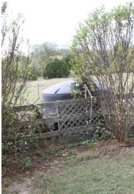
The 1500 gallon tank