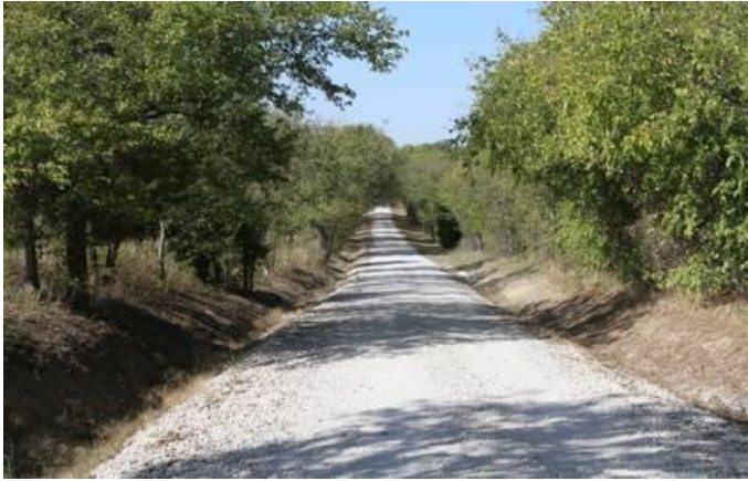
County Rd in Celina, TX

Did you know there is a little piece of paradise located in Celina, TX? When you first turn off the main road onto a gravel covered County Rd you know you're leaving the real world behind and entering a different environment.