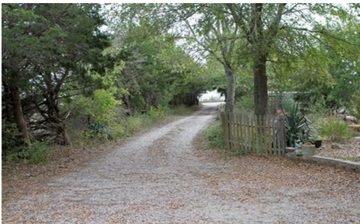
Tree lined drive of Ray and Hortense Pittman

The countryside itself is beautiful but down this country road a little bit the landscape reveals an even more beautiful tunnel formed by the overhead branches of a tree lined driveway. Turning down this drive the first thing that greets you is a railroad lantern, the signature of former railway worker Ray Pittman, as we approach the home of Ray and Hortense.