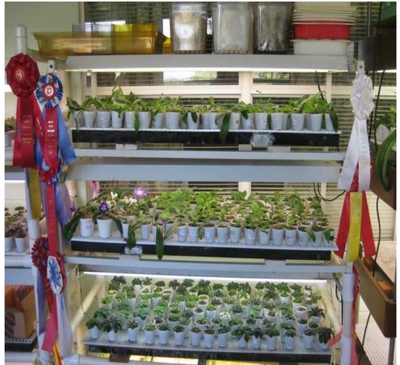
above: Violet minis (lower shelves) share the plant stand with baby Streptocarpus