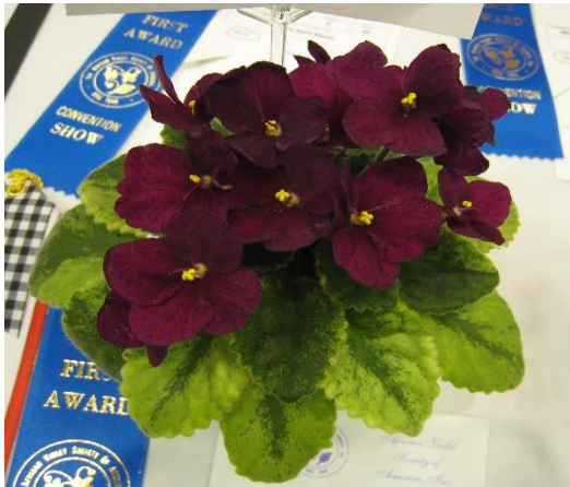
Celina Dark Velvet