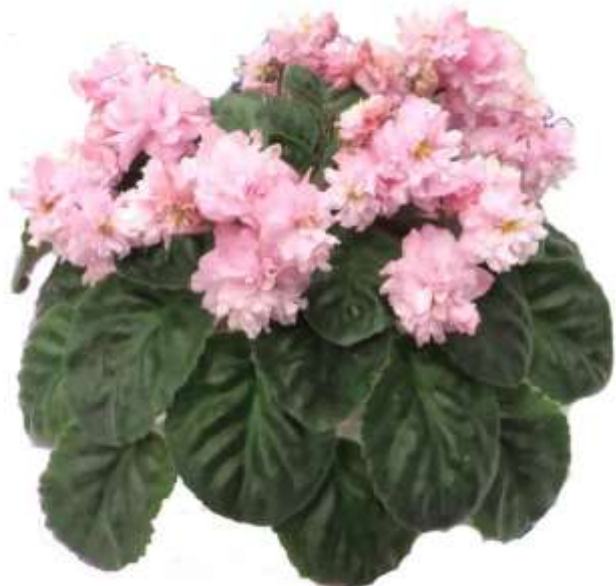
Dumplin', shown by Dale Parker, LSAVC 2016

8:30 p.m. – 10:30 p.m. Exhibits removed from Showroom